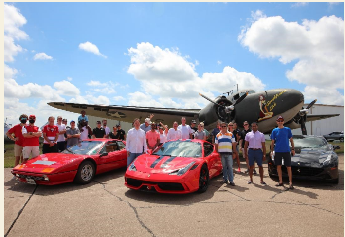
Goodtime Gal enjoys some sunlight and great company