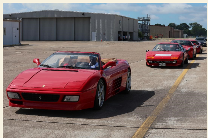
Ferrari’s joining us for the Hanger Hangout