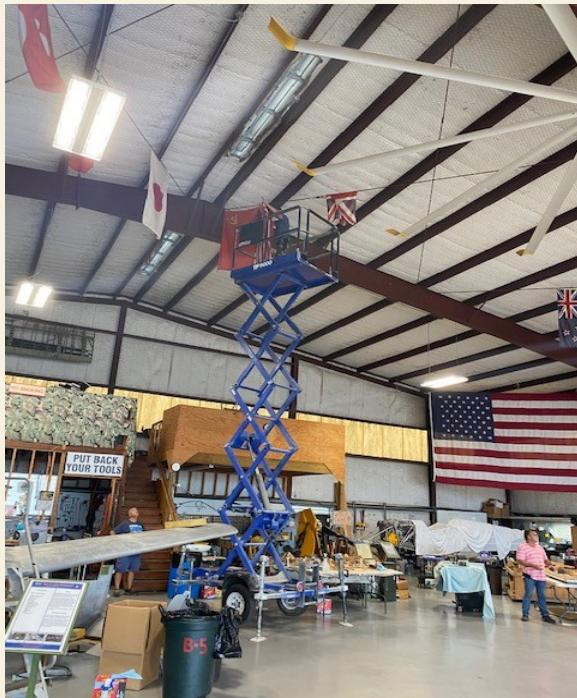
It's a good thing Conor Walker is not scared of heights!!