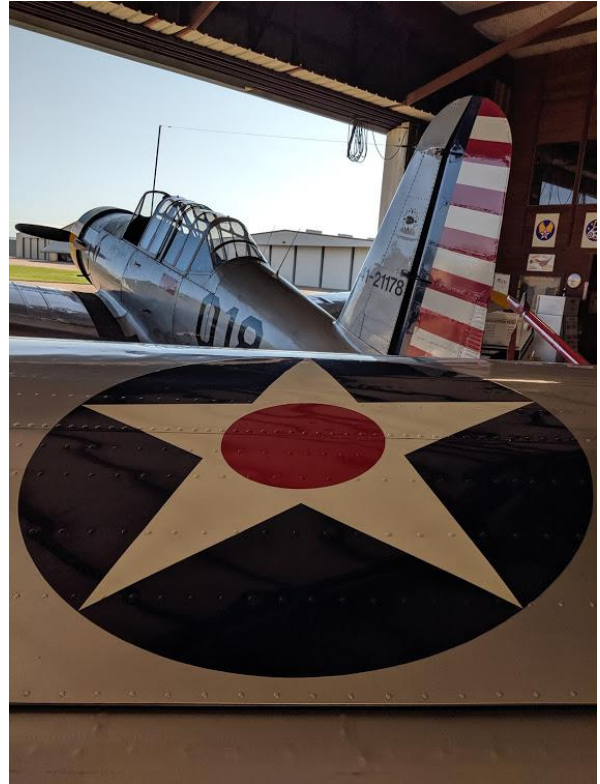
Shiny and Clean for Airshow.