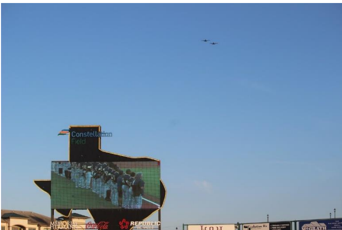
Skeeters Flyover.