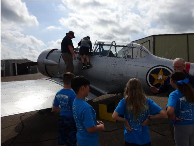
How an aircraft works Getting into AT-6 Cockpit

THE HOUSTON WING WISHES ALL THE DAD'S A VERY HAPPY FATHERS DAY!!